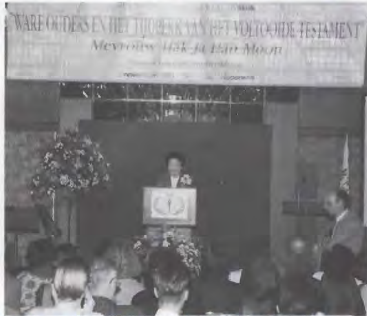
Mother speaking in The Hague, Netherlands, on November 5, 1993.

I was told that people in the Netherlands have a special ability to learn foreign languages. What about learning Korean? Whether you like it or not, you will have to go to the spirit world someday; if you cannot speak Korean what will you do?