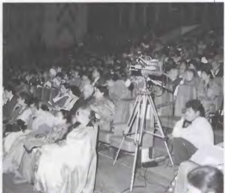
The audience in the Air Force Auditorium on December 20, 1993.