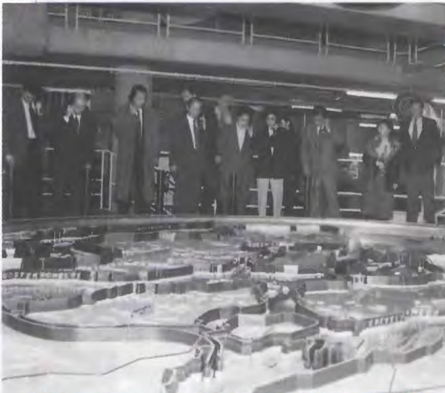
Mother and her entourage take a moment out of their busy schedule to visit the museum displaying the dike system in the Netherlands.

Based upon the foundation of victory already laid by True Parents, even external conditions are helping us. Wherever I go to deliver this speech, the weather welcomes me, even creating miracles for me. For example, this summer while I was touring America, there were severe floods. The entire city of Des Moines, Iowa, was flooded and the highways were closed. For two weeks people could not get into the city, and all the hotels were closed. The day of my speech was approaching. The day before I arrived, the city was still flooded and the hotel at which I was scheduled to speak was still closed. We were desperate; yet I was confident. The hotel finally opened the night before I was supposed to speak. When we arrived at the hotel, although it had not opened completely, several floors were open and I was able to speak. The weather had been terrible; rainy and overcast, but as I was traveling to the city, sunshine followed me. It had been raining, but as I arrived the sun started shining and while I was speaking the sky was bright. Everyone was happy to get out of their houses and away from the flood, so they came to the speech. The next morning, by the time I left the city it had started to rain; one day after I left, the city was once again entirely closed. We can call that a miracle. We experienced countless miracles like