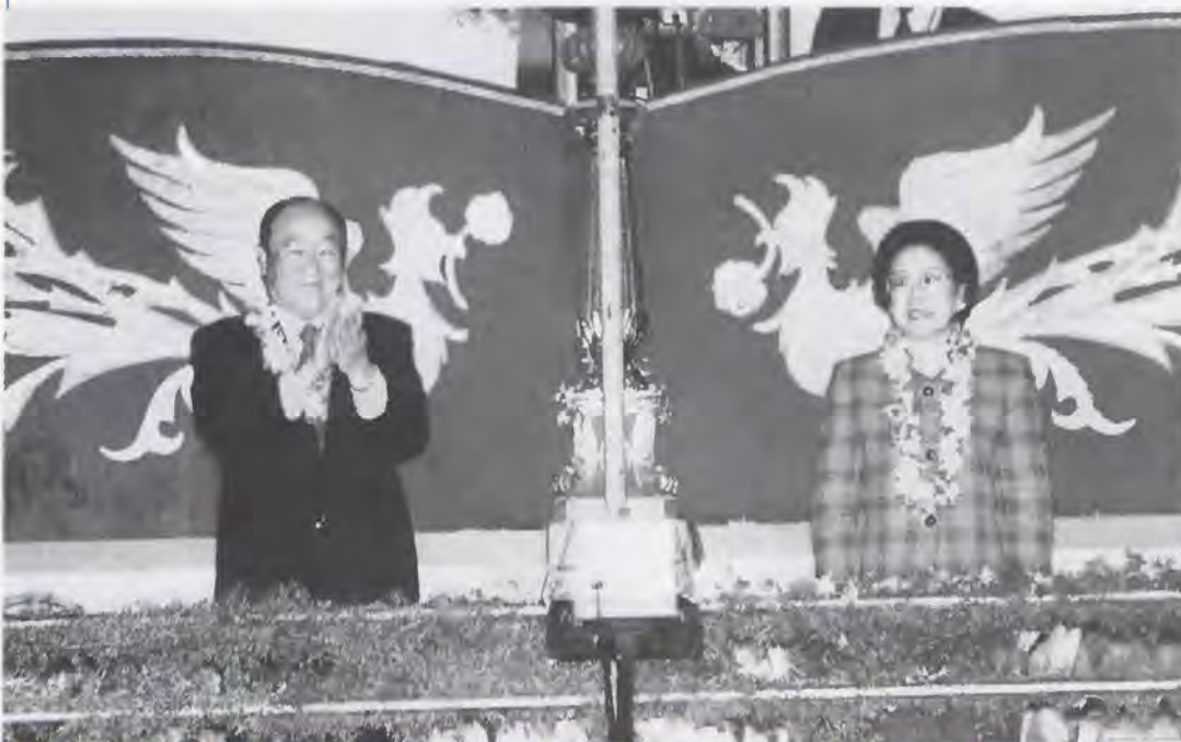
Father and Mother greet the members at the evening entertainment in the Manhattan Center Grand Ballroom.

When I began my ministry, my parents, brothers and