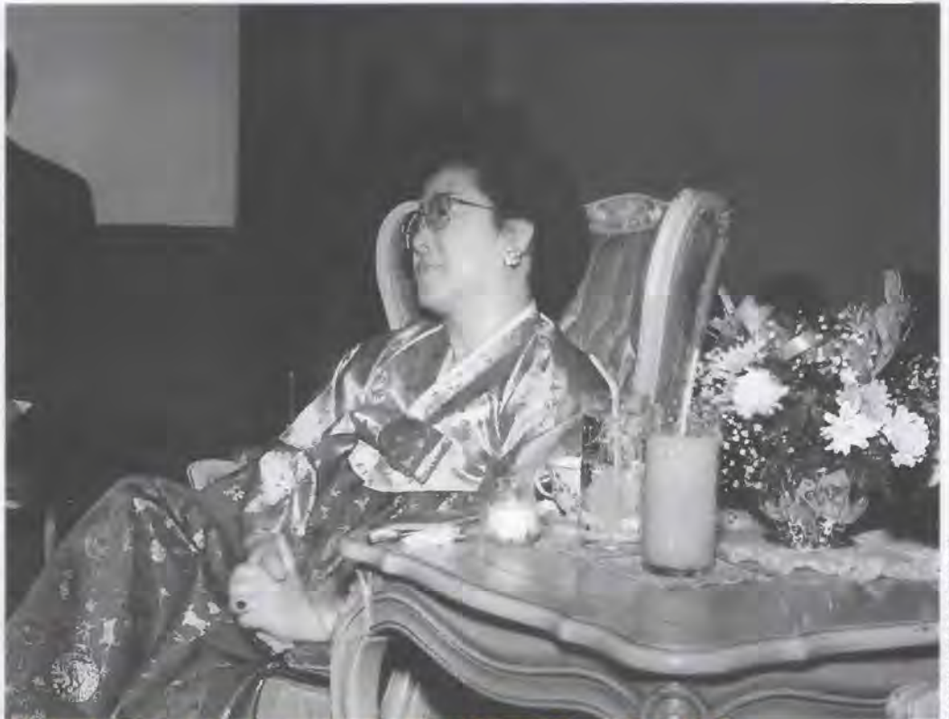
Mother listens to Father's speech in the World Mission Center Grand Ballroom.

I became involved with former Presidents Nixon and Carter during their administrations because the United States cannot afford weak leaders that will surrender to communism. This is a Christian nation, and it will ultimately revive, because God loves America. Christianity cannot be completely destroyed because God worked with Christianity for 2,000 years and wants it to succeed in the end.