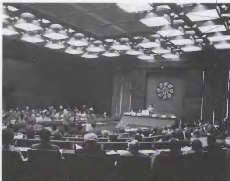
Mother speaking at the Indian Parliament in New Delhi, India, on December 20, 1993, prior to her public speech that same day.